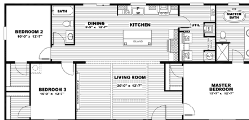
MODEL #PCH28563A DRAWING # 30M001 28' x 56' THE KINGSLAND