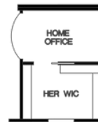
HOME OFFICE OPTION