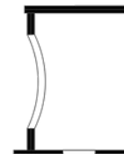
ADULT RETREAT OPT.